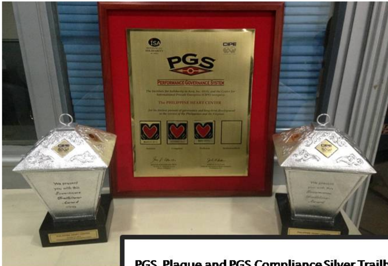
PGS Plaque and PGS Compliance Silver Trailblazer Award & PGS Proficiency Silver Trailblazer Award