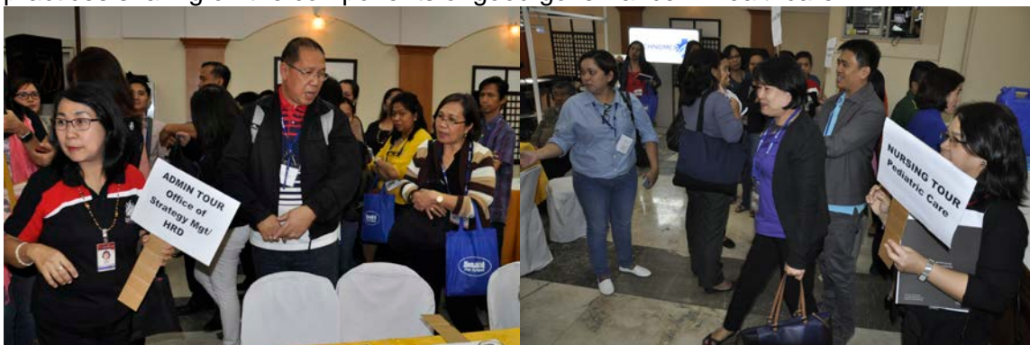
The organizers and participants during the Hospital Tour

As part of the culminating activities of the summit, the delegates went on a hospital tour to the 4 areas of PHC, the Office of Strategy Management, Nursing Services, Administrative Services and Medical Services. These areas were the basis of the best practices sharing on the components of good governance in healthcare.